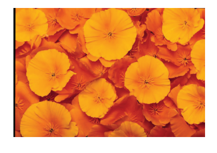
Beautiful time of year

Ed went on a walk around the neighborhood a few weeks